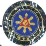
RODRIGO ROA DUTERTE President of the Philippines