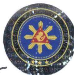
RODRIGO ROA DUTERTE President of the Philippines