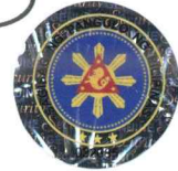
RODRIGO ROA DUTERTE President of the Philippines