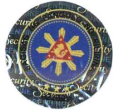
RODRIGO ROA DUTERTE President of the Philippines